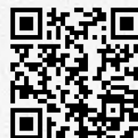
Award Nomination Google form QR Code

Email: aiaspga.vns@gmail.com Website : www.aiaspga.in